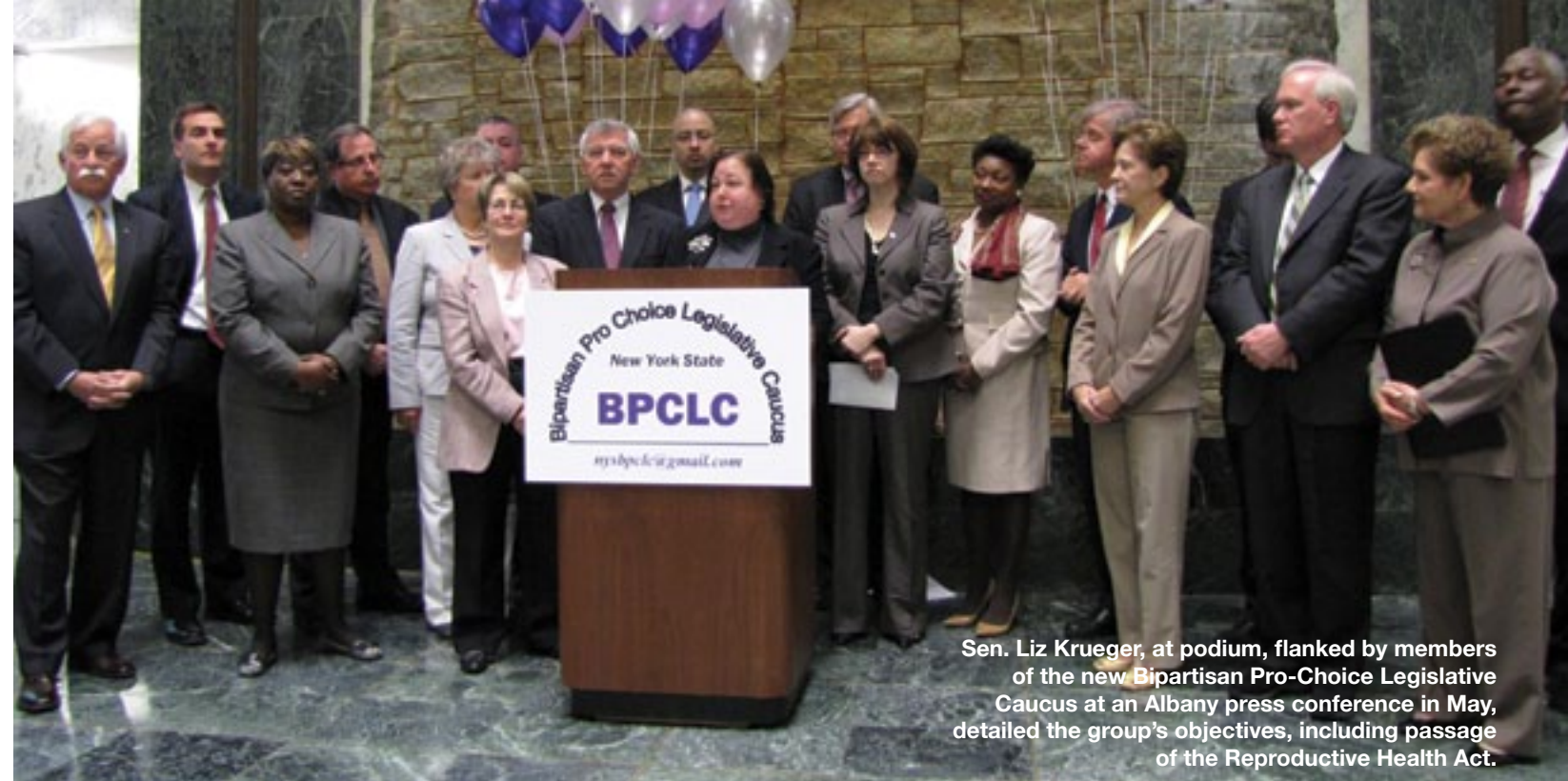
Sen. Liz Krueger, at podium, flanked by members of the new Bipartisan Pro-Choice Legislative Caucus at an Albany press conference in May, detailed the group's objectives, including passage of the Reproductive Health Act.